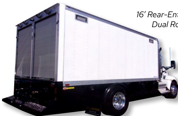
16' Rear-Entry Body with Dual Roll-Up Doors