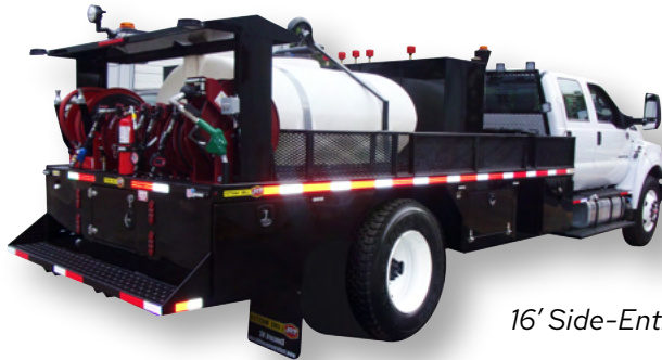
16' Side-Entry Body